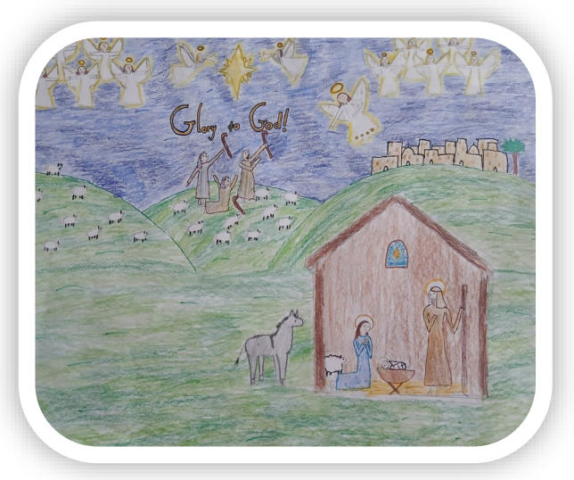
3rd age 8-11yrs Maja Passler Co422 High Wycombe