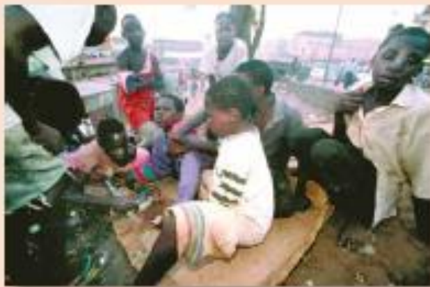
Comboni Mission • Spring 2019

In 2017, I was transferred to the Comboni Missionaries commu-