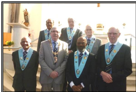
The Supreme Knight with the officers of Province 30.